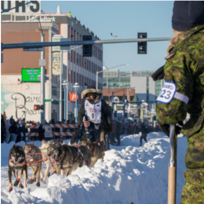
CAF member looks on as a mushing team races by on the Canadian section of the trail in Anchorage.