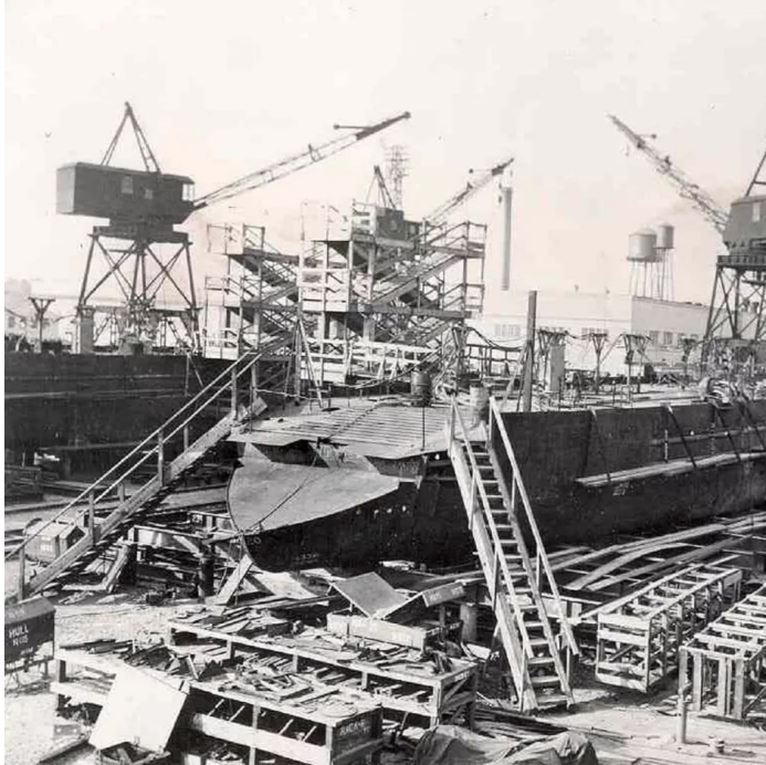
Wilmington, DE shipyard during WWII.