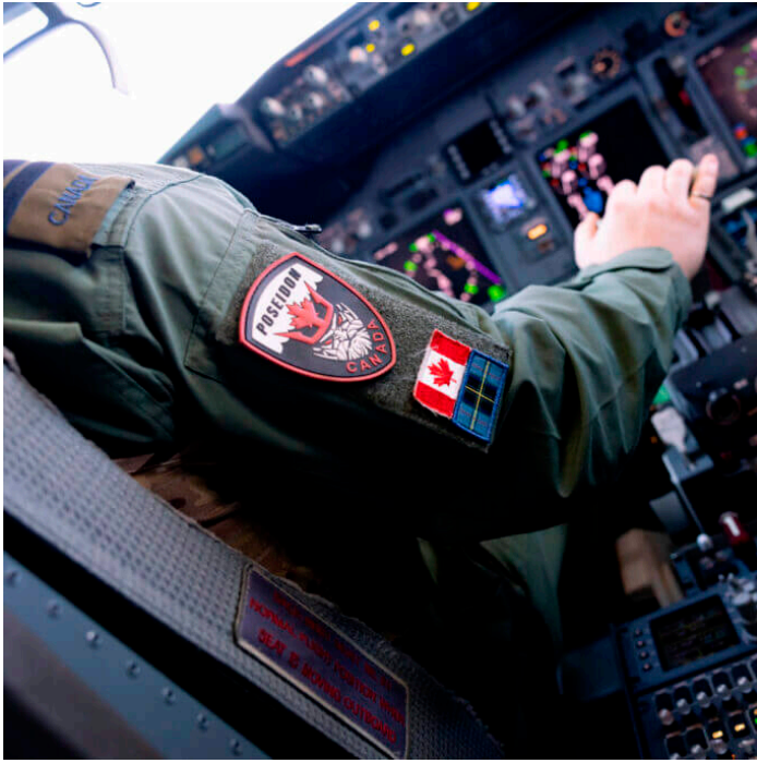
Boeing P-8A.