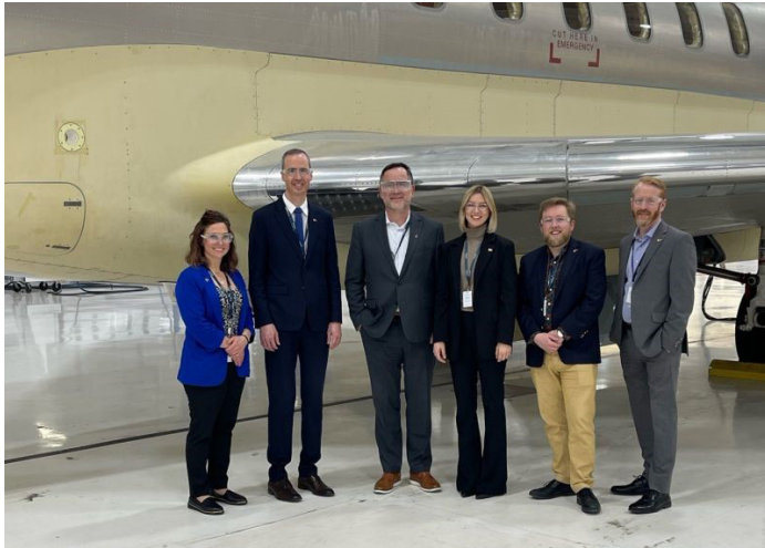
Bombardier Defense Challenger 650.