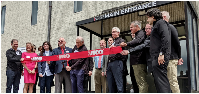
Ribbon cutting ceremony for the new IKO facility in Hagerstown.