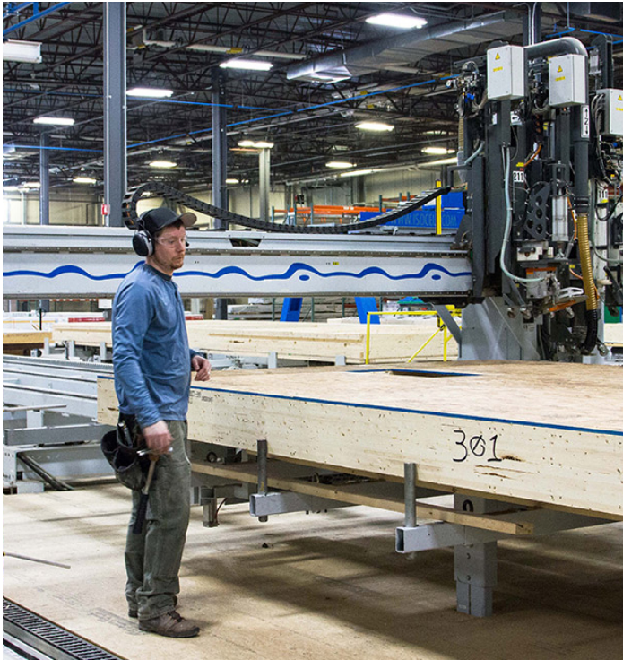
Bensonwood's Walpole factory.