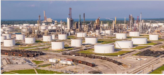
Cenovus' Toledo plant.