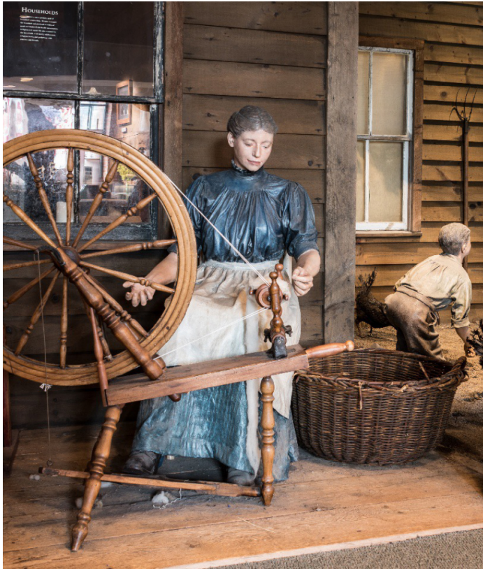
Museum of Work and Culture in Woonsocket, RI.