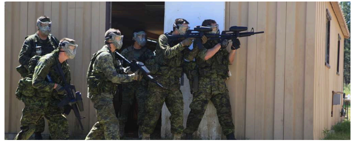
Canadian Armed Forces clear rooms during Golden Coyote.

This partnership highlights the benefits of Canada–U.S. economic partnership that creates local jobs, supports manufacturing in South Dakota, and makes progress on energy security.