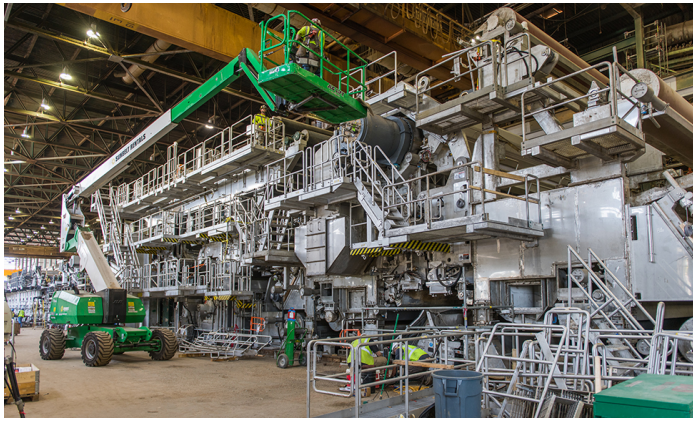
Bear Island facility.